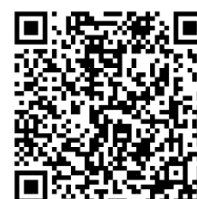
Summer Luggage Storage Dormitory Commitment Form QR code

3. Students who have successfully applied to remain in their original rooms for the next semester can store their luggage in their dorm rooms. This service is available only for students residing in Dormitories 1, 4, 5, and 6. If