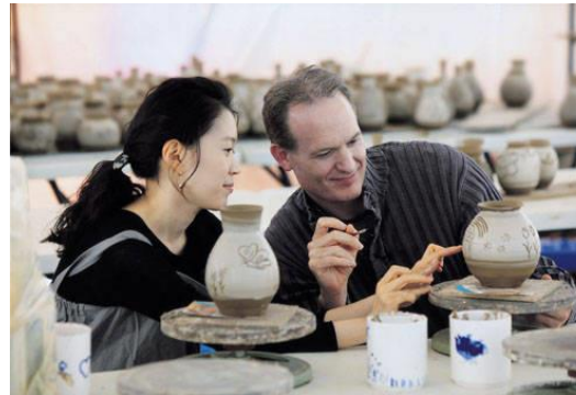
Making Pottery 8/5(Mon)