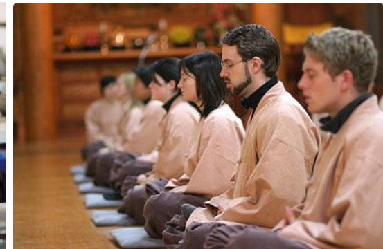
Temple Stay 8/13(Wed)