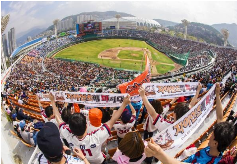
Baseball Game 8/12(Mon)