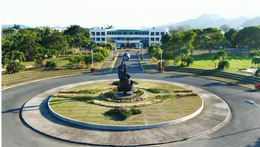
The UPOU main campus in Los Baños, Laguna sits at the foot of Mt. Makiling

The main venue of the youth cultural and learning immersion program is at the UPOU main campus in Los Baños, Laguna. Taiwanese youth will be billeted at the UPOU Academic Residences for the entire duration of the said program.