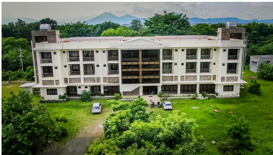
The UPOU Academic Residences can house over 100 individuals